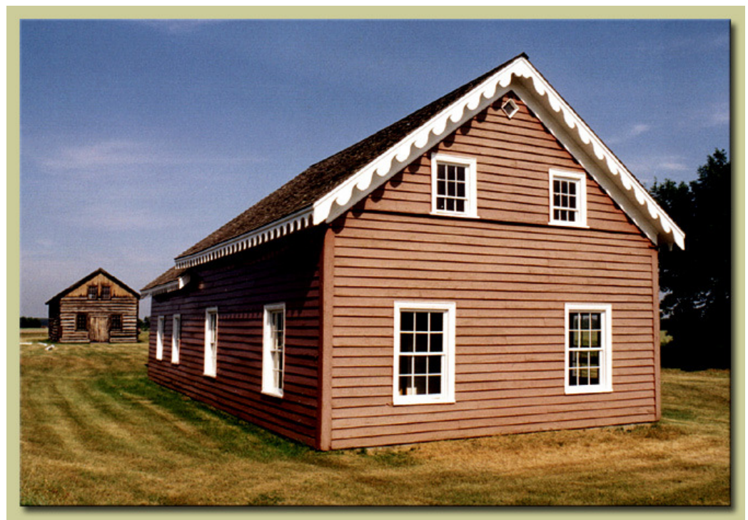
Louis Riel was hidden on the 2<sup>nd</sup> floor of this house after the 1869-70 Resistance