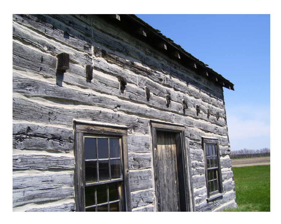
Two views of the restored trading post. Photos by Lawrence Barkwell, May 2009.